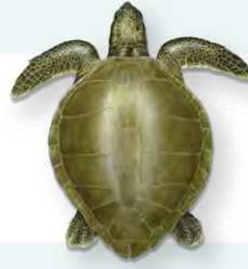
Olive ridley Lepidochelys olivacea