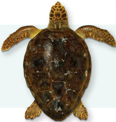
Loggerhead Caretta caretta