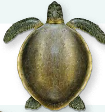
Flatback Natator depressus