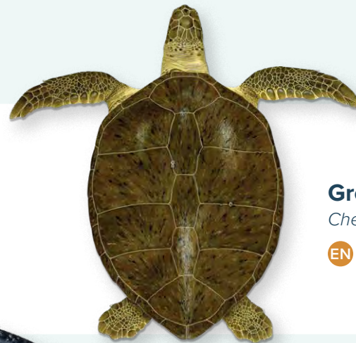
Green Chelonia mydas