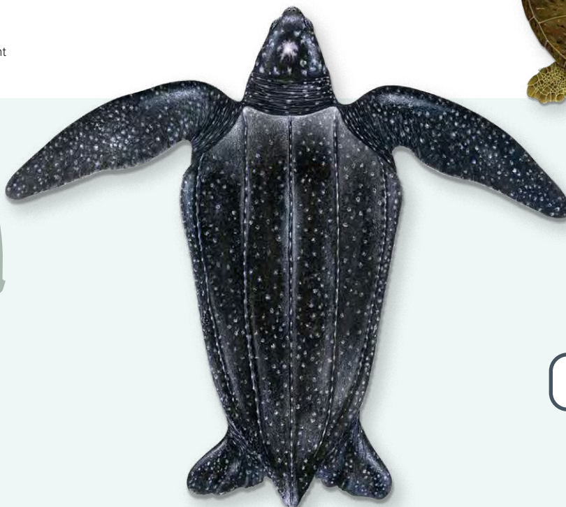
Leatherback Dermochelys coriacea