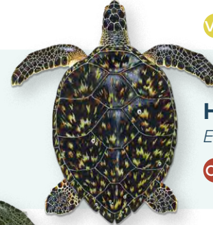
Hawksbill Eretmochelys imbricata