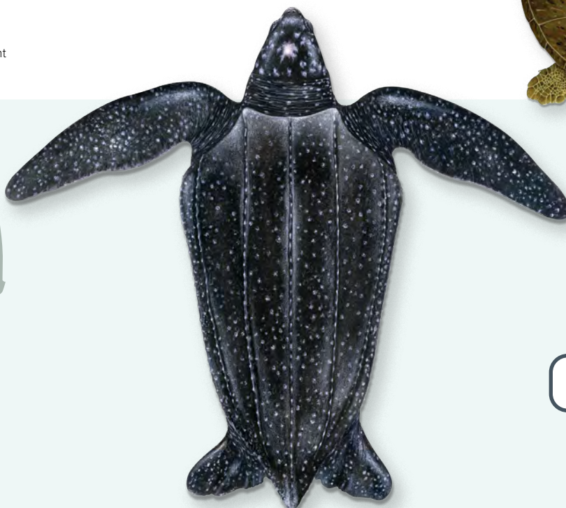
Leatherback Dermochelys coriacea