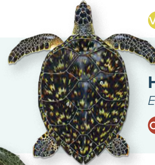
Hawksbill Eretmochelys imbricata