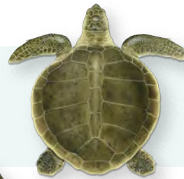
Kemp's ridley Lepidochelys kempii

The seven sea turtle species that grace our oceans belong to an evolutionary lineage that dates back at least 110 million years. Sea turtles fall into two main subgroups: (a) the unique family Dermochelyidae , which consists of a single species, the leatherback, and (b) the family Cheloniidae , which comprises the six species of hard-shelled sea turtles.