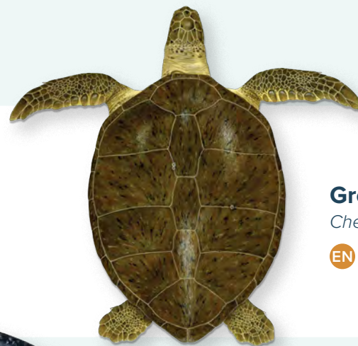
Green Chelonia mydas