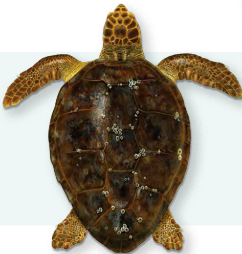
Loggerhead Caretta caretta