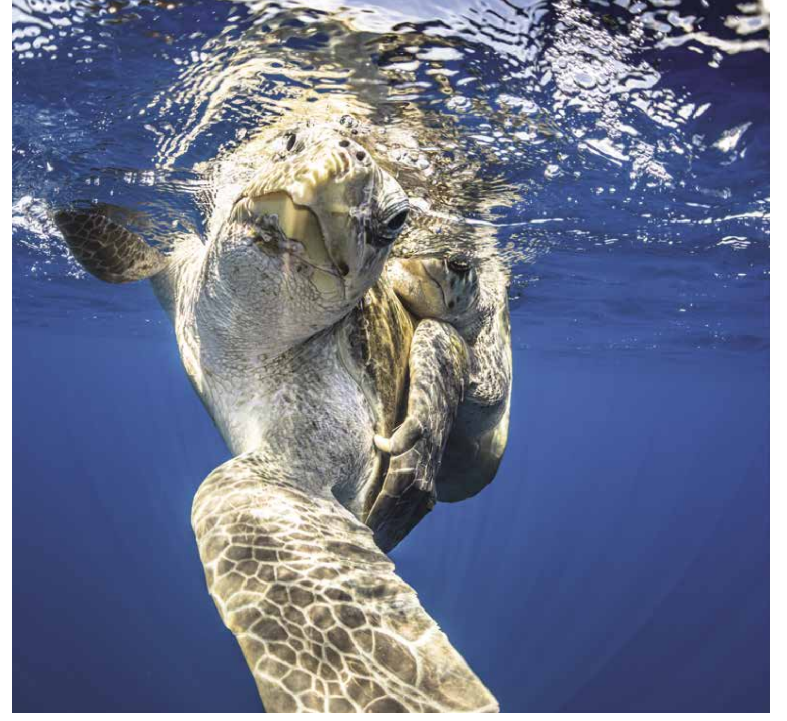
Olive ridley turtles mate off the coast of the Osa Peninsula in Costa Rica.